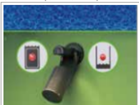
ANTI-FOAM SYSTEM WITH SPECIAL ELECTROMECHANICAL SUCTION MOTOR PROTECTION