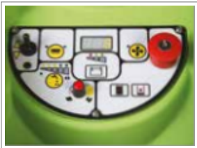
INTUITIVE CONTROL PANEL

10/13 gal 20" brush drive and traction drive