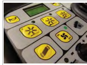
EASY TO USE CONTROLS